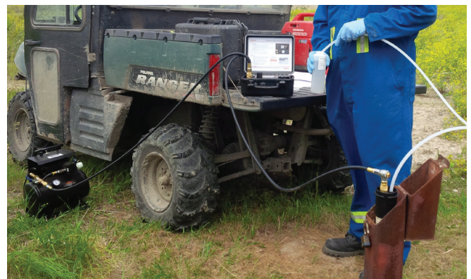
Sampling with a Dedicated Bladder Pump using Portable, Rugged, Easy-to-use, Compressor and Controller

For water level monitoring there is an access hole to fit a Solinst Model 101 Water Level Meter or Levelogger. An eyebolt is provided for a pump support cable or for suspension of a Solinst Levelogger, (see Model 3001 Data Sheet) or other device.