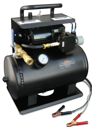
12 Volt Compressor

The compressor operates using 12 volt DC power source, such as a car or truck vehicle battery, and comes with alligator clips. The compressor operates at up to 125 psi and is equipped with a 2 US gallon (7.6 L) air tank which is rated to 150 psi.