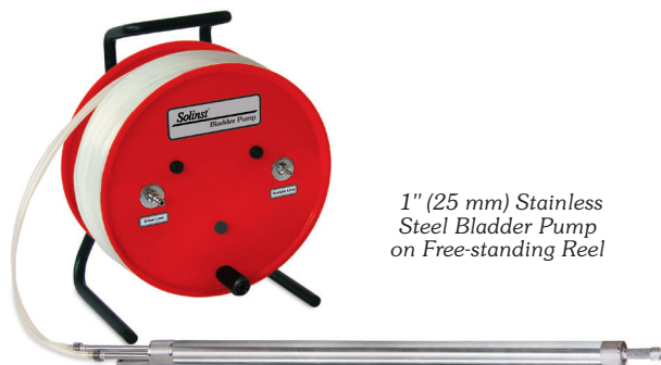
1" (25 mm) Stainless Steel Bladder Pump on Free-standing Reel

They are supplied on a free-standing reel. The rugged systems are very convenient and easy to transport. Tubing fittings on the reels and controller are compression fittings, allowing quick set up in the field. The Solinst Model 103 Tag Line can be used to lower and support the pump in the well (see Model 103 Data Sheet).