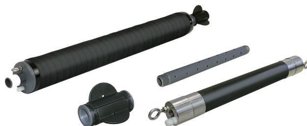
Model 800 Packers 3.9" and 1.8" (99 mm and 46 mm)

Model 800 Low-Pressure Packers can be used with Solinst Bladder Pumps to minimize purge times by reducing purge volumes. This reduces the cost of water disposal and labour. Packers are available in single point or straddle packer designs, and in sizes to fit 2" (50 mm) to 5" (127 mm) dia. wells. (See Model 800 Data Sheet.)