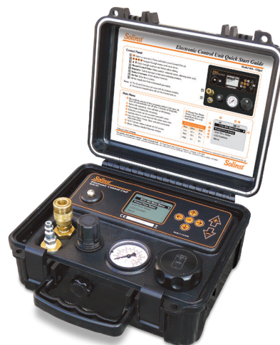
Model 464 Electronic Control Unit (125 psi and 250 psi Models)

These convenient Controllers are rugged, dependable and suitable for all environments. Quick-connect fittings allow instant attachment to dedicated well caps, portable reel units and to an air compressor or compressed gas source.