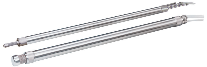
Solinst Bladder Pumps available in Stainless Steel 1" and 1.66" (25 mm and 42 mm).